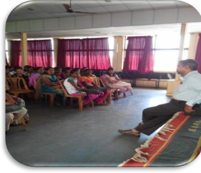
In house Project