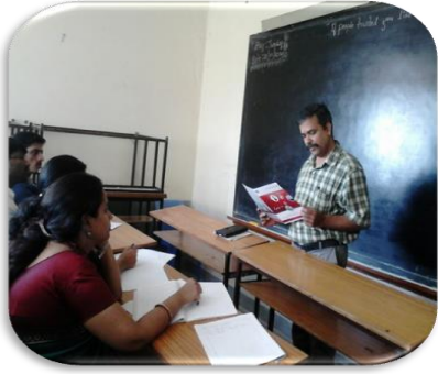
Faculty Development Program